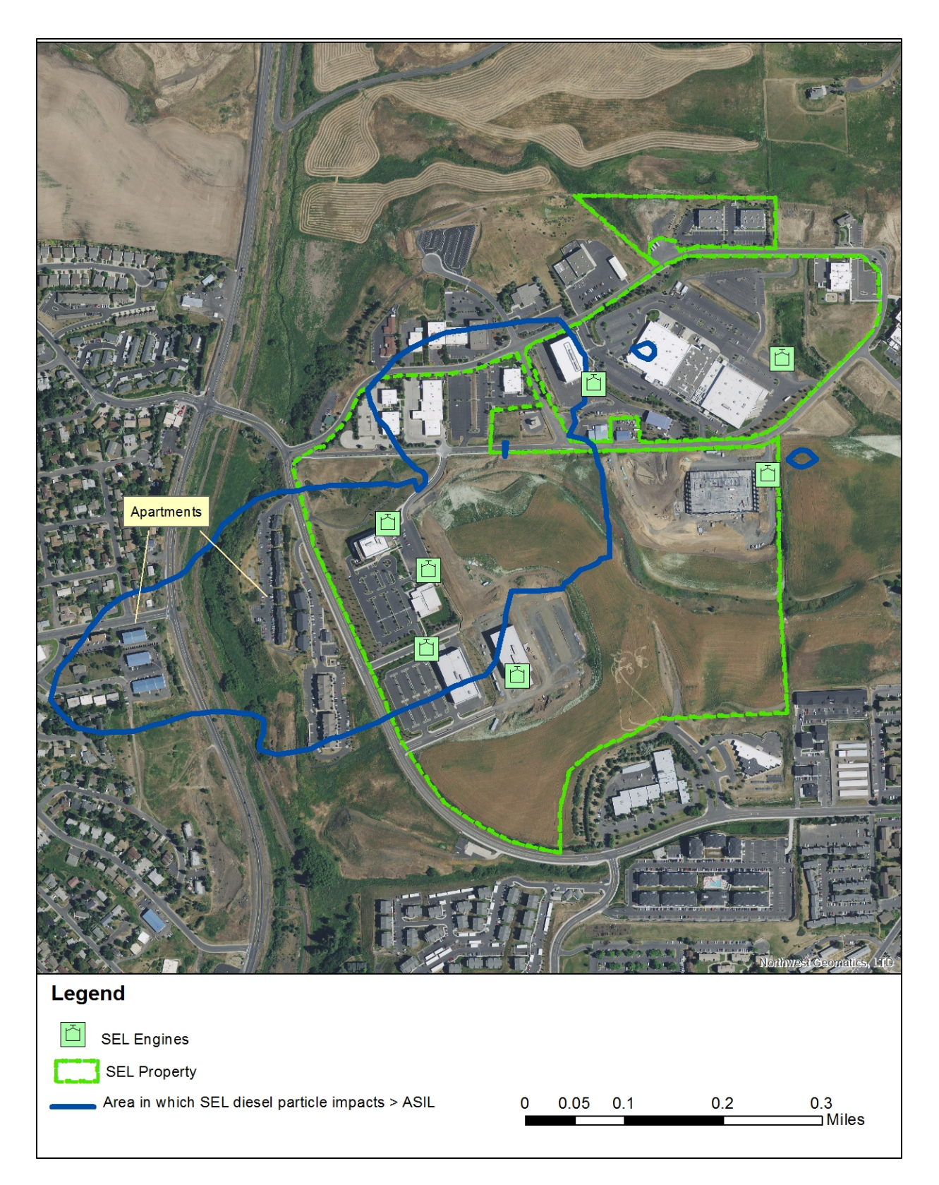
Figure 1: Area where proposed SEL DEEP emissions may cause impacts that exceed the ASIL