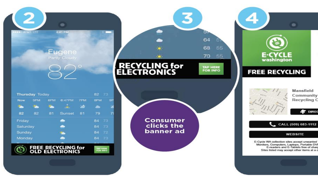
Consumer sees complementing ad on phone allowing for immediate action.

Ad delivers critical information, such as distance to business location and opportunities for more information.