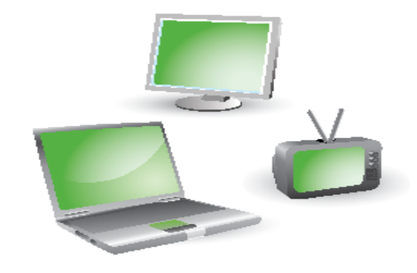
E-Cycle Washington is a program that provides free recycling of computers, monitors, laptops and TVs.