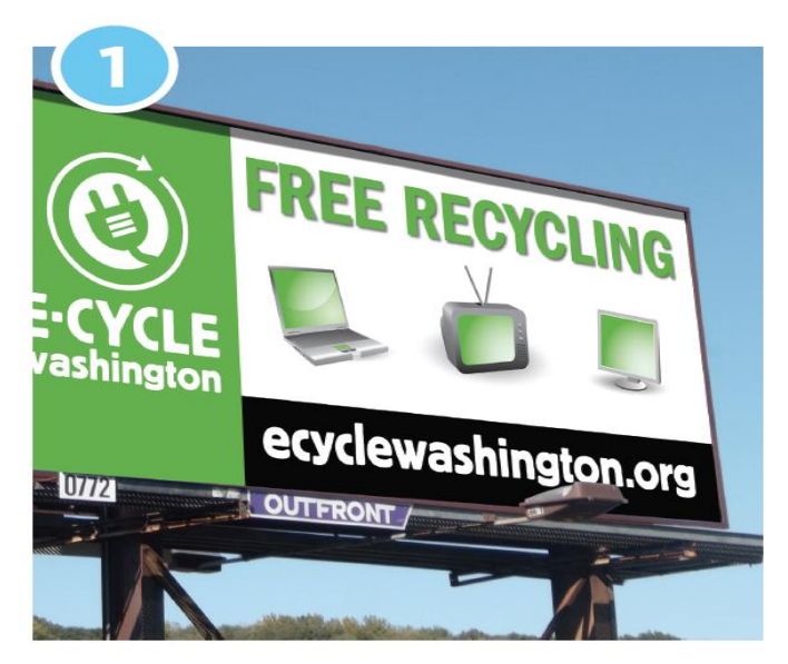
Consumer sees OOH advertisement

The WMMFA also contracted for Mobile ads generated via proximity to the billboard campaign ads. The mobile campaign in the Tri Cities area generated a click thru rate of .55% Secondary Action rate of 12.22% by utilization of the billboards and landing page as illustrated below (over a one month period). The mobile campaigns in the Quincy, Yakima, Shelton, and Quincy areas had a similar click thru rate and secondary action rate of 5.52%