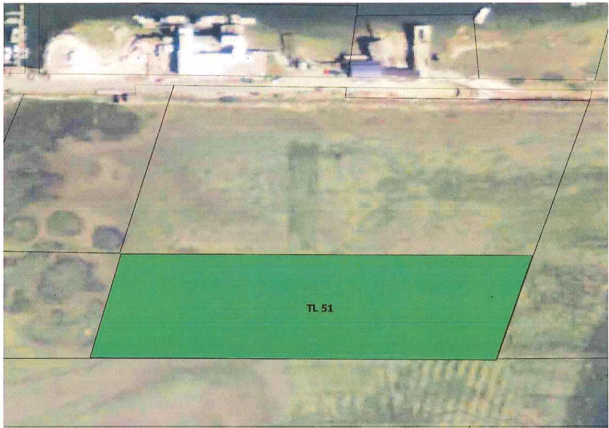
Figure 4. Parcel 121122755051.