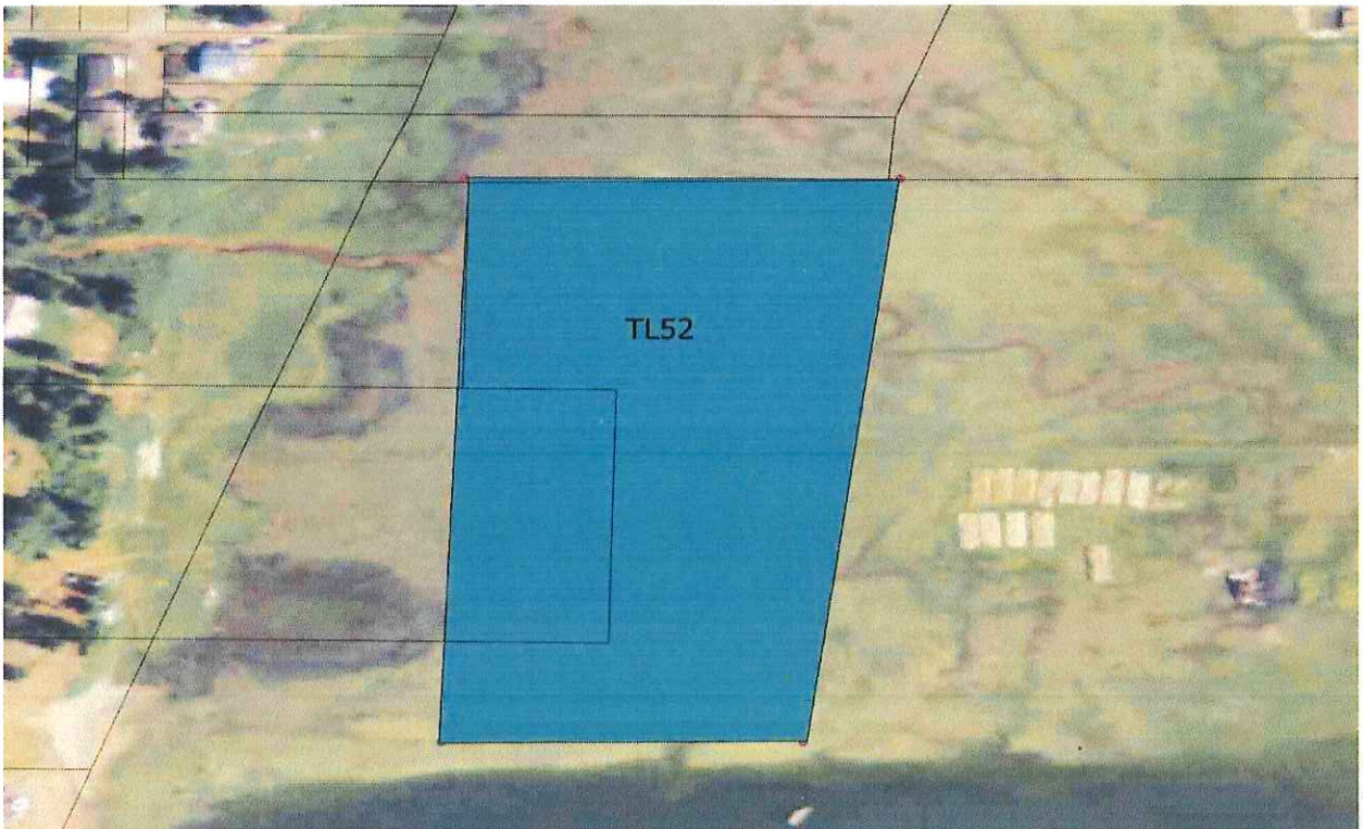
Figure 2. Parcel 12112755052.