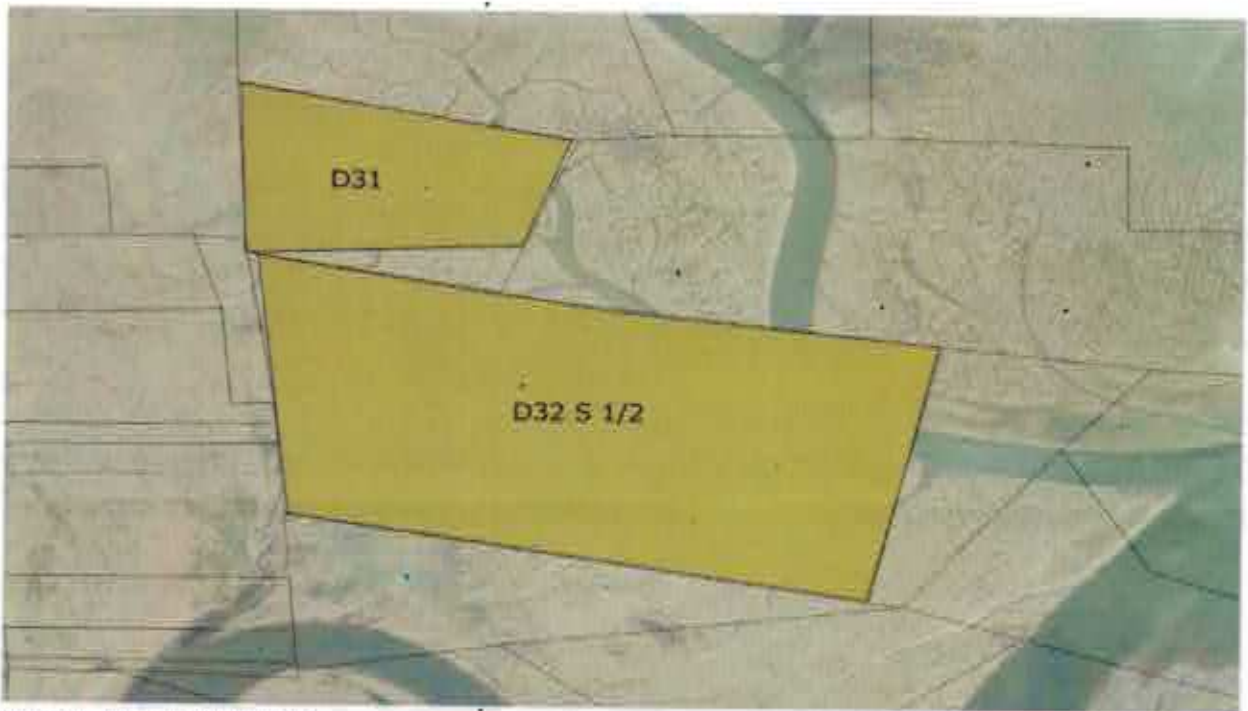
Figure 3. Parcel 7900400003