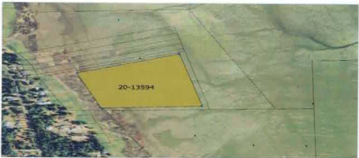
Figure 1. Bed 20-13592

Figures 1-5 show the proposed locations of japonica treatments in 2016. In 2015 treatments occurred on bed D26.