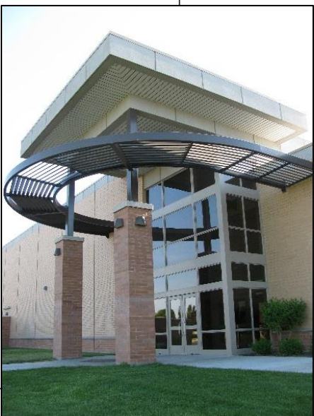
Front Entrance of the ATEC building.