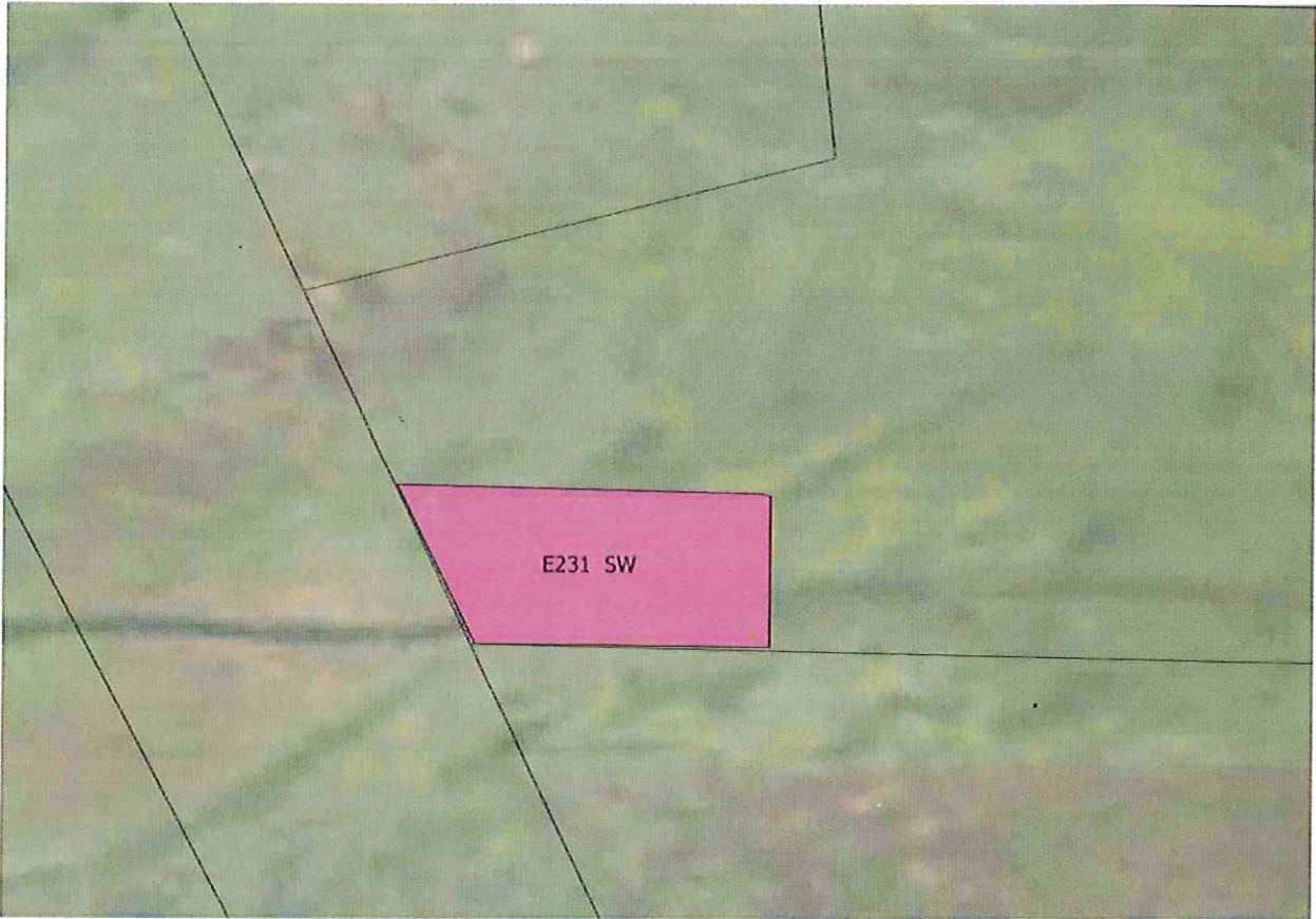
Figure 2. Parcel 79005002231