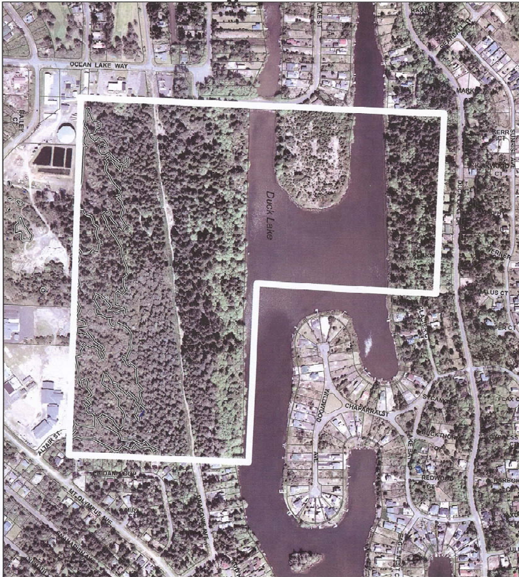
FIGURE 2 -- Weatherwax Property, Wetland Areas, and Easement