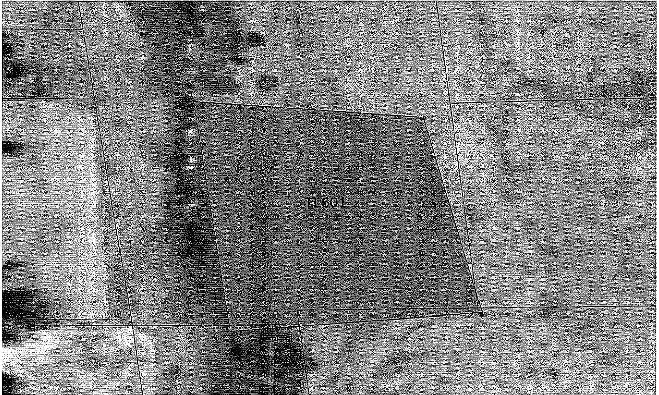
Figure 2. Parcel 1112255601