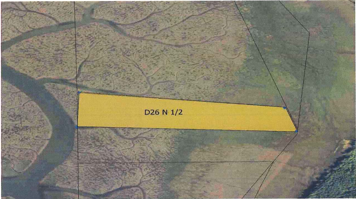
Figure 2. Parcel 79004006026.