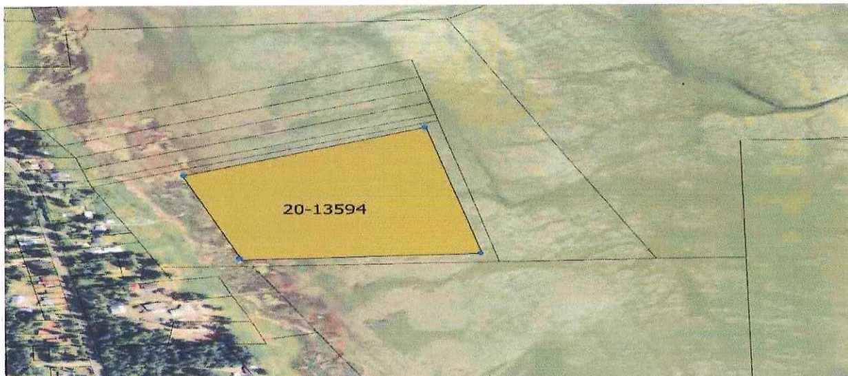
Figure 1. Bed 20-13592.

Figures 1-5 show the proposed locations of japonica treatments in 2016. In 2017 Long Island Oyster did not treat commercial clam beds for the control of zostera japonica .