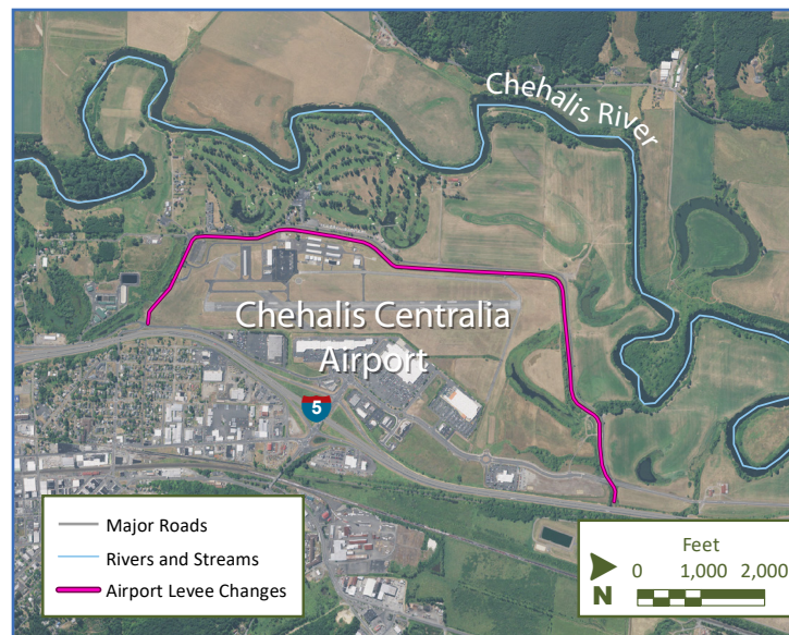
Chehalis-Centralia Airport Levee Changes