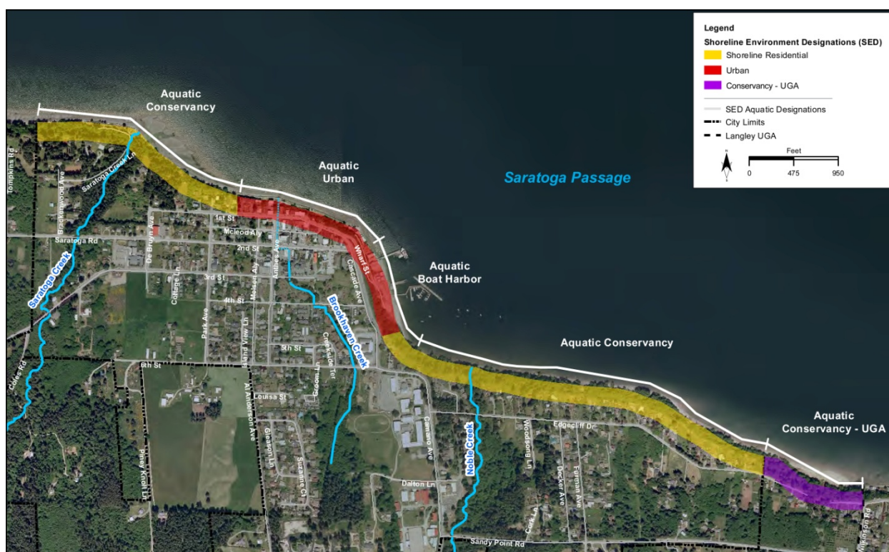
Figure 2. Shoreline Environment Designations