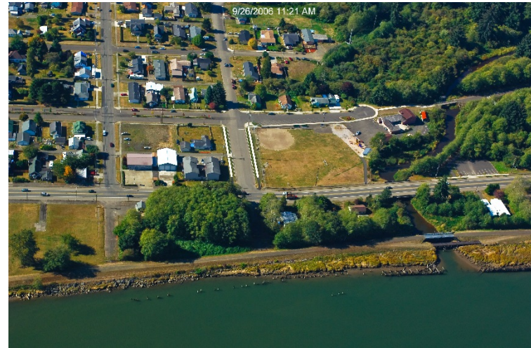
Mouth of Mill Creek with Control Structure in Chehalis River Reach - South in Cosmopolis.