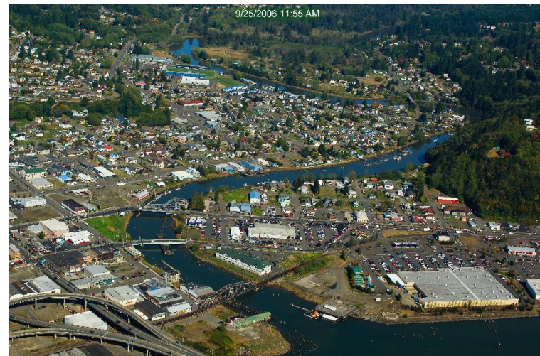
Wishkah River Reach in Central Aberdeen.