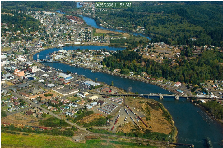
Hoquiam River Reach - East (right) and Hoquiam River Reach - West (left).