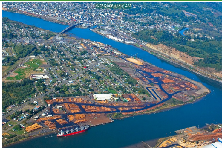
Chehalis River Reach in Aberdeen.