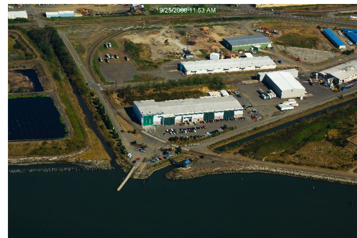
Fry Creek Reach in Hoquiam.