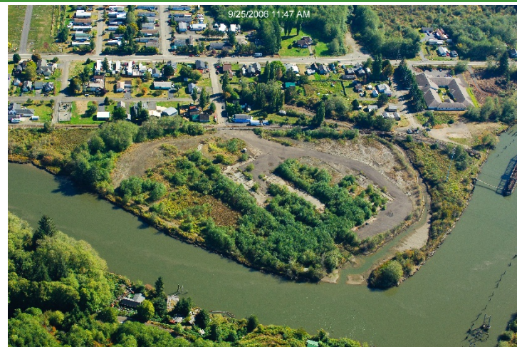
Former Channel and Development in East Fork Hoquiam Reach.