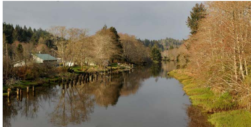
Little Hoquiam Reach.