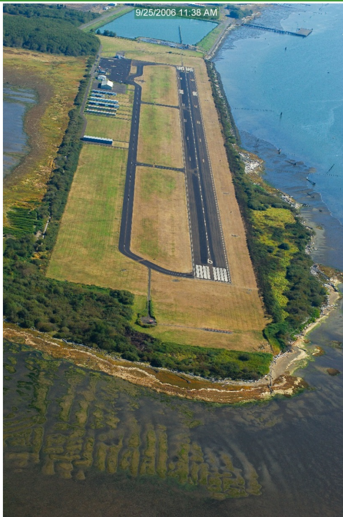
Fill at Bowerman Airport in Grays Harbor Reach in Hoquiam.