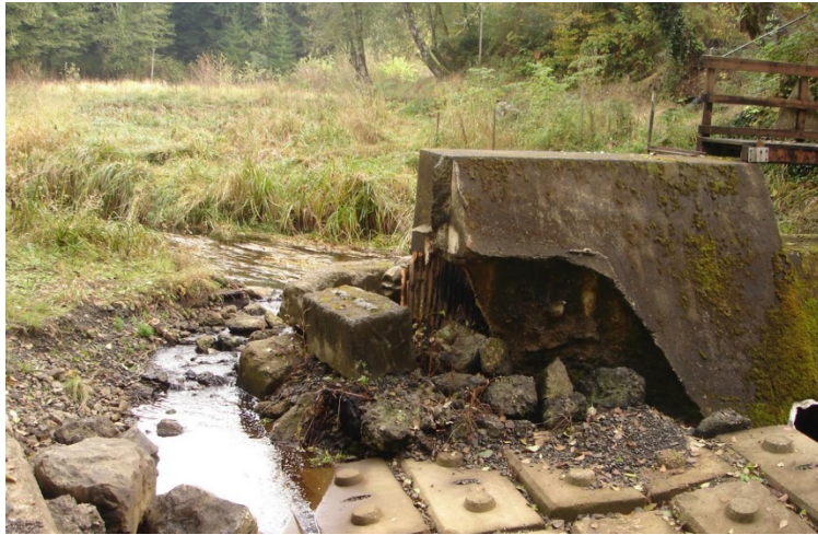
Mill Creek Dam Breach in Mill Creek Reach.