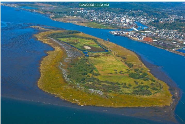
Rennie Island in Grays Harbor Reach.