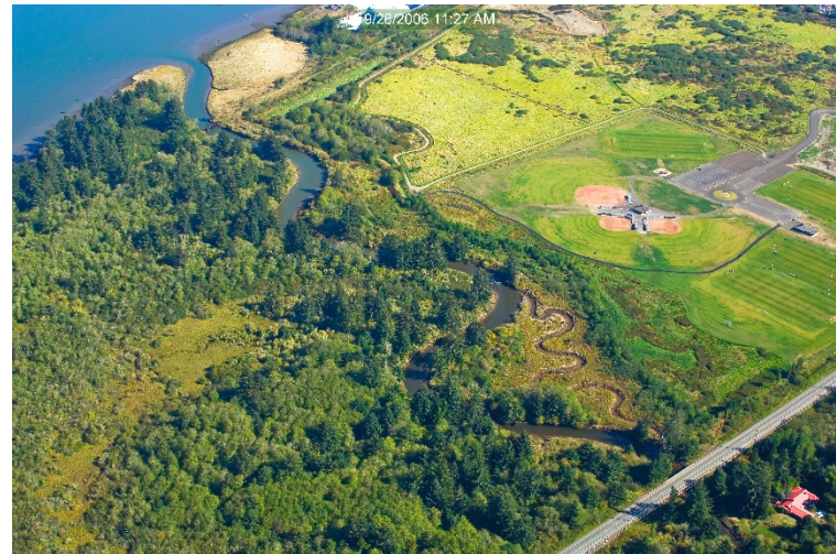
Newkah Creek Reach.