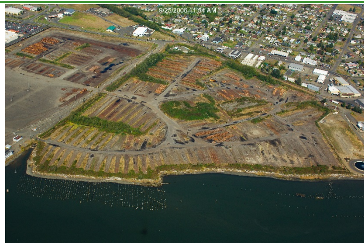
Fry Creek Reach in Aberdeen.