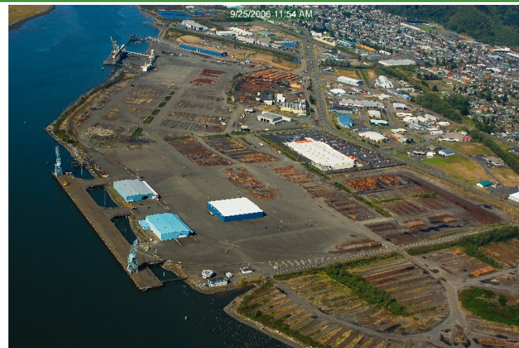
Fill in Grays Harbor North Bank Reach in Aberdeen.