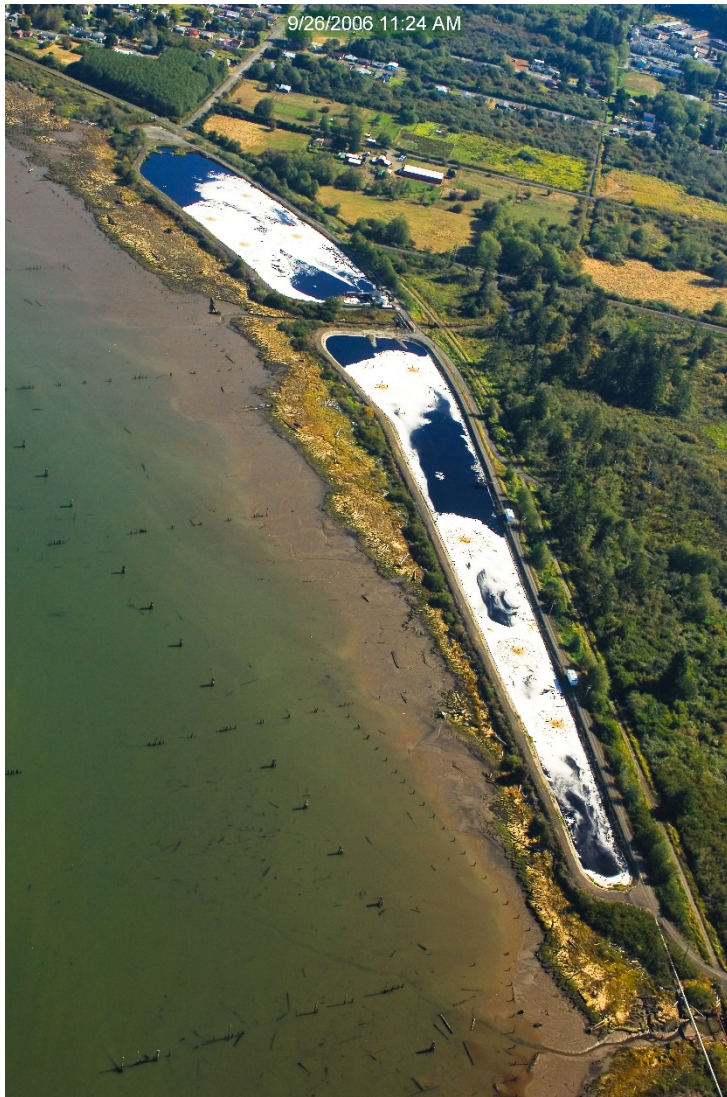
Grays Harbor South Bank Reach.