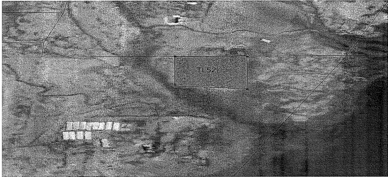
Figure 3. Parcel 12112755052