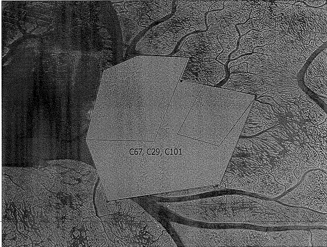
Figure 5. Parcel's 79003000067, 79003000029, 79003000101