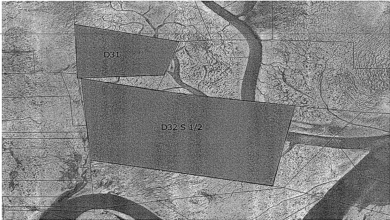
Figure 4. Parcel 7900400003