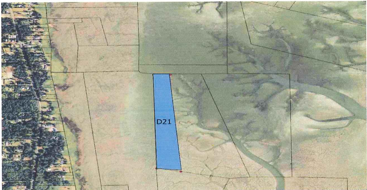
Figure 1. Parcel 79004000021.

Figures 1-2 show the proposed locations of japonica treatments in 2016. In 2017 Station House Oyster did not treat commercial clam beds for the control of zostera japonica .