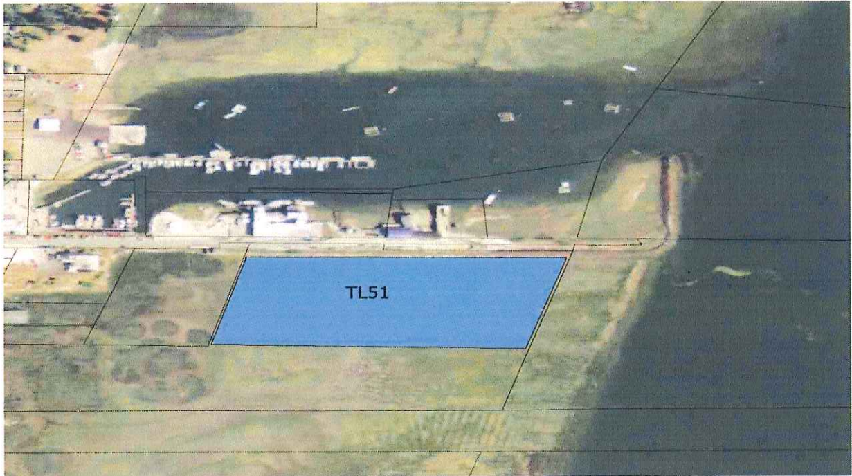
Figure 2. Parcel 12112755051.